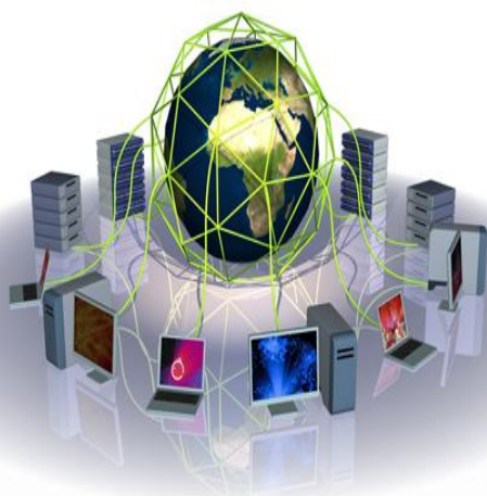
Figure 1: Grid computing

Grid computing is a combination of –PaaS, IaaS, SaaS . As (IaaS) Infrastructure as a service, it provides hardware and network facility to the end user; thus end user will itself installs or develops its own OS, Software and application. As (SaaS)