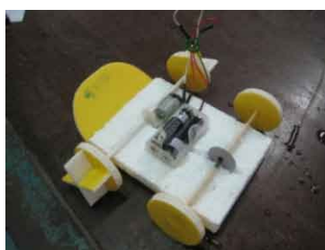
Figure 3: Team 4's styrofoam boat (1 st place).

In the first contest, only the boat created by Team 3 completed the course, taking a total of 5 seconds; five of the teams failed because the motor could not drive the boat forward, one did not fully complete their boat, and one forgot to bring their boat to the contest. In the final contest, four teams (Teams 1, 3, 4 and 6) succeeded and took 7, 5, 3, and 9 seconds to run through the course, respectively. Figures 3 to 6 display the four successful boats ranked from 1st to 4th place. The other four teams failed mainly due to gear (mechanics) and motor (electricity) problems (see Figures 7 to 10).