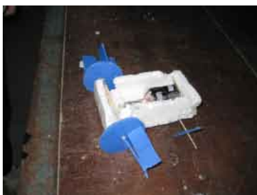
Figure 7: Team 2's initial boat.