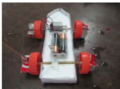
Figure 6: Team 6's styrofoam boat (4 th place).