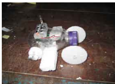
Figure 9: Team 7's plastic bottle boat.