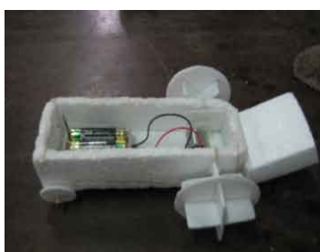
Figure 4: Team 3's styrofoam boat (2 nd place).