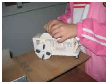
Figure 8: Team 5's milk carton boat.