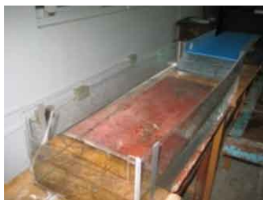
Figure 1: The course.