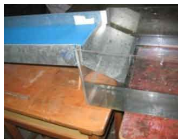
Figure 2: The slope.