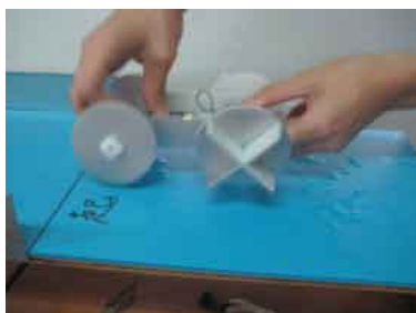
Figure 10: Team 8's pearl board boat.

As shown in the figures, the boats made by each team differed in style and material. The materials used to make the hull included styrofoam, pearl board, a milk carton and a plastic bottle. Pearl board was used by six of the teams for making wheels; one team (Team 6) chose plastic milk bottle caps and another one used styrofoam. The observation data indicate that all of the teams continuously modified their boat before and after the first contest, including changes in material, shape, and/or size. According to the interview data, the considerations for making the modifications consist of increasing thickness (e.g., replacing the foil hull with Styrofoam), easier cutting (e.g., replacing the styrofoam with pearl board), and easier propulsion (e.g., halving a hull). All of the teams added cross pieces as oars to either two or four of the wheels, reportedly to enhance the propelling force. Only one team (Team 4) did not add sides to its boat. After testing their boats, the students were more focused on the functional perspective of the modifications, rather than on its aesthetic appearance, when deciding on and changing the boats' materials and size. That is, the boat's appearance was eventually sacrificed for functionality. In addition, the content results reveal that turning a static artefact into a scientific functional work, appears to demand a certain extent of science knowledge and hands-on skills, in addition to initial creativity.