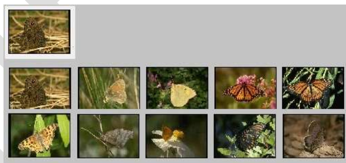
Fig 3 Retrieval Result

The total number of relevant correctly retrieved images and the total number of retrieved images obtained from each of the query performed is recorded. For each query, the recall and precision values will be interpolated. The average precision at each recall level for each image category is then calculated. The time complexity also calculated and time taken for the retrieval is less than other systems.