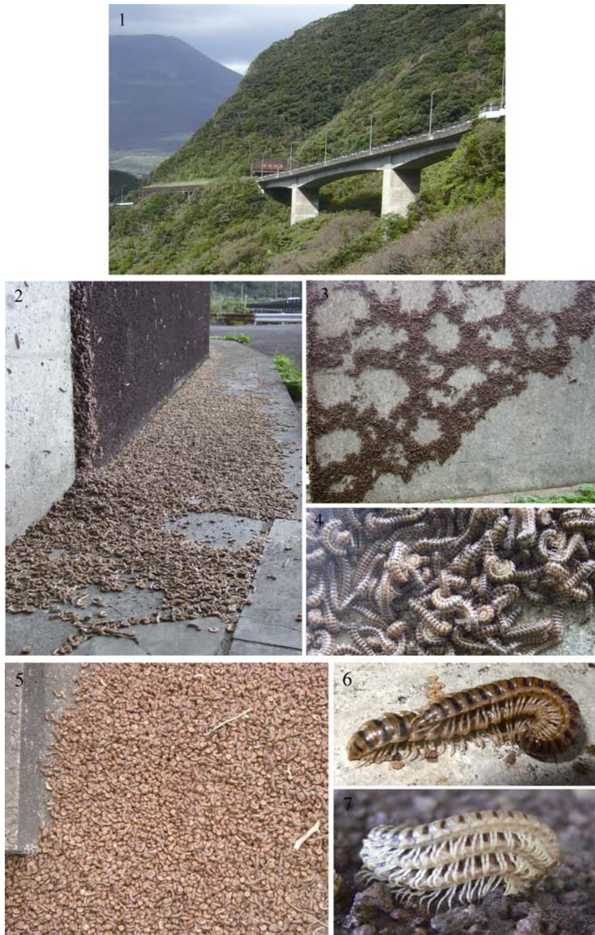
Figure 1 Area of mass outbreak (Seen from the west with freeway viaduct in the centre and mountains on the far side (to the east) of the road; the tunnel entrance is to the left)