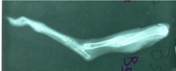
Fig. 3: Radiological findings of fracture healing (grade 3).