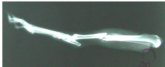
Fig. 1: Radiological findings of fracture healing (grade 1).

Radiographs of the leg were done on the day of the procedure and then repeated after 4 weeks. Fracture healing evaluated blindly by radiologist according to a 5 point scale describing the degree of callus density (degree of mineralization) and the degree of fracture line visibility 14 as in Figures1-3, and table I.