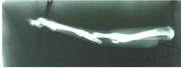
Fig. 2: Radiological findings of fracture healing (grade 2).