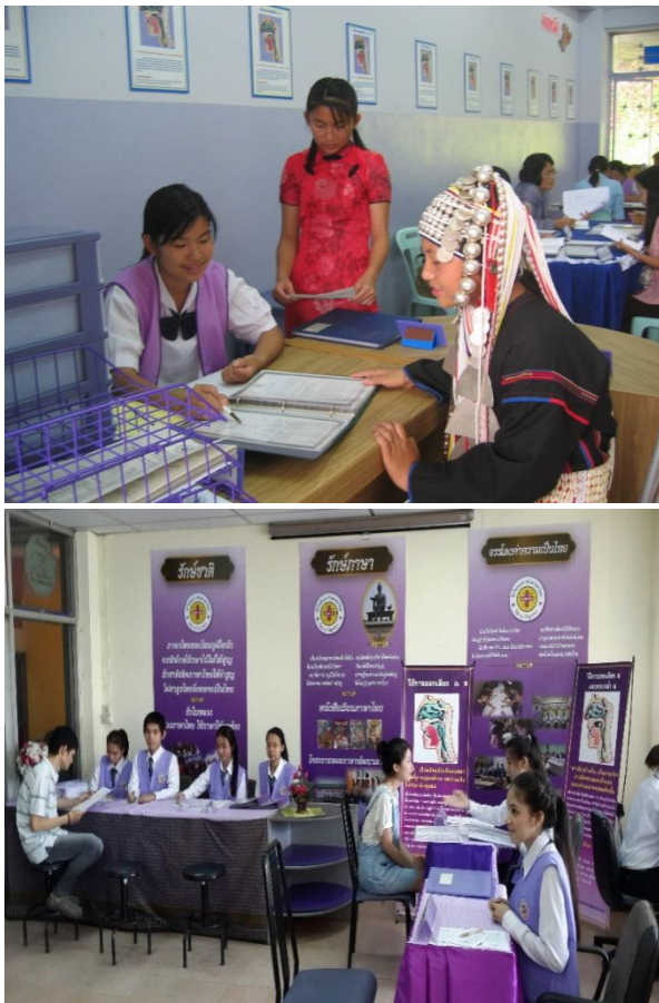
Figure 4. Morbhasa Clinic services in tackling Thai pronunciation problems

the language. The success and sustainability of the transmission depends on the following four factors: the character of the innovations, the character of key personnel, the strength of the network and inspiration. The Morbhasa project has been sustainably transmitted 'bottom-up' and accepted by practitioners for 16 years. The leaders of the initiative, who work hard with sacrifice, commitment, high attention, perseverance and their own human qualities, clearly are the keys to sustainable transmission and acceptance.