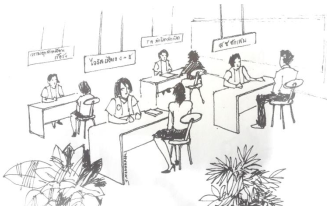
Figure 1. Morbhasa (Language Therapist) Clinic

The objectives of Morbhasa clinics (Figure 1) are to set learning activities for the network of institutions to tackle the problems of the Thai language usage, to strengthen teachers’ and learners’ realization of the importance of the Thai language, to develop youth skills as leaders in tackling the problems and to praise and encourage good users of the Thai language. These learning activities are set for Morbhasa in the network of institutions.