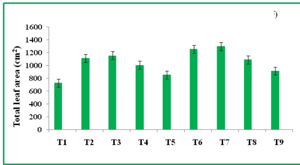
Fig. 1. Effect of fertigation levels on total leaf area per plant (m 2 )

micronutrient mixture as foliar spray on 15 days interval (T 7 ) registered significantly the highest total leaf area