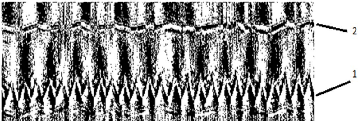
Figure 3 – The example of decomposition into array

Analysis of the research results shows opportunities of inter-frame changes amplification. The example of accentuation associated with a movement of the hands is in Figure 2.