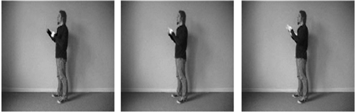
Figure 2 – The example of inter-frame changes accentuation

Analysis of the research results shows opportunities of inter-frame changes amplification. The example of accentuation associated with a movement of the hands is in Figure 2.