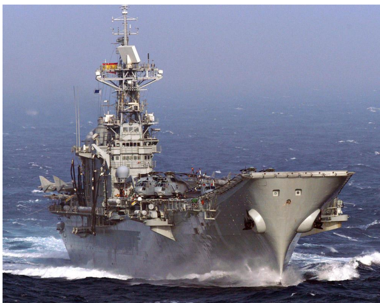
Spanish aircraft carrier «Principe de Asturias»

Due several economic restrictions, Armada Española to take decision decommissioned our only one Aircraft carrier: “Príncipe de Asturias”. Part of operational functions will be assumed by “Juan Carlos I”, a new multi-purpose warship (similar in concept to the American Wasp-class amphibious assault ship) it was commissioned two years ago. This has not prevented the loss of their Harrier fighters.