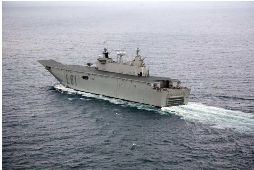
Ship base "Juan Carlos I"

Concerning Shipbuilding be that tough times have been overcome, because few days ago Government of Turkey has announced that the partnership formed by Navantia and SEDEF will build new LHD ship base "Juan Carlos I" class. Remember that Navantia yard was constructor of two twin ships to Australian Navy. Also is probably built this year platform-ship for PEMEX Company too.