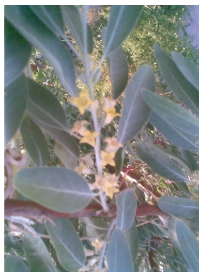
Fig. 2: Flowers of Elaeagnus .

Fruits are dry and ellipsoid to oblong in shape with thick stony endocarp. The species is distributed from Spain in west to China in the east through western and central Asia (Hooker, 2). In India, the species is found in Ladakh, the Western Trans-Himalayan region of the country. Elaeagnus angustifolia is usually a thorny shrub or small tree growing to 5–7 m in height. Its stems, buds, and leaves have a dense covering of silvery to rusty scales (Fig.1). The leaves are alternate, lanceolate, 4–9 cm long and 1–2.5 cm broad, with a smooth margin. The highly aromatic flowers, produced in clusters of 1–3, are 1 cm long with a four-lobed