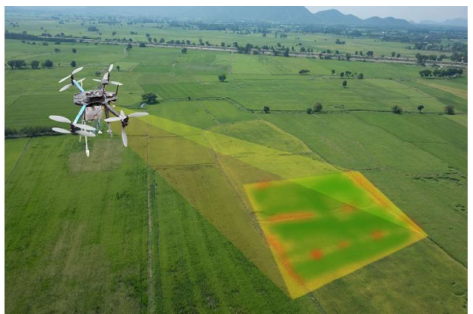
Figure 3. Use of drones in precision agriculture (Sela, 2022)