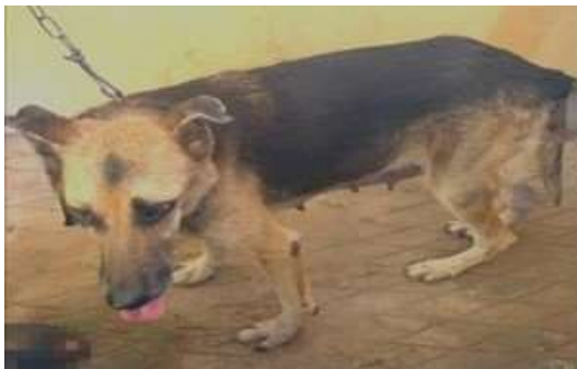
Figure 1: A 7-year-old German Shepherd bitch as presented to the Veterinary Teaching Hospital

Signalment and History: On 12th December 2022, a 7-year-old German Shepherd weighing 21 kg was presented to the Veterinary Teaching Hospital (VTH) at the University of Ibadan, Oyo State, Nigeria. The owner complained of a swollen mammary gland a few months after a failed expected whelping. According to the owner's account, there had been no successful whelping since the last mating, despite it seeming to be successful. The patient's mammary gland had kept swelling, and the bitch had successfully whelped twice prior to the failed whelping (Figure 1). The owner also reported previous use of antibiotics.