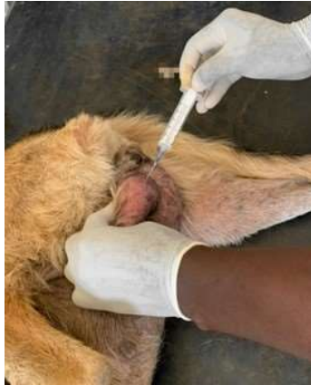
Figure 4: Fine needle aspiration of the inguinal mammary gland of a 7-year-old German Shepherd bitch