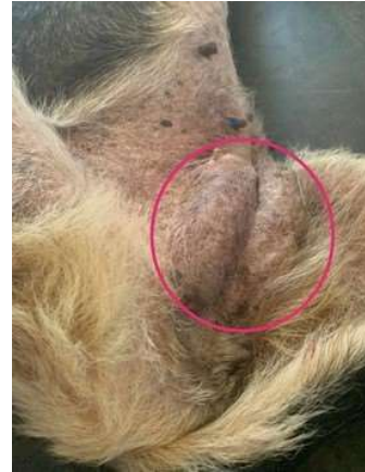
Figure 2: Swollen inguinal mammary gland of a 7-year-old German Shepherd bitch

Physical Examination: The patient exhibited dullness, anorexia and moderate cachexia. The bilateral inguinal mammary glands were markedly swollen, firm and warm to the touch (Figure 2). Additionally, the bilateral popliteal lymph nodes were swollen, with a consistency similar to that of the mammary gland (Figure 3).