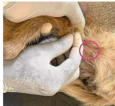
Figure 3: Swollen Popliteal Lymph Node of a 7-year-old German Shepherd bitch

The patient's body condition score was evaluated and scored 2/5. The mucous membrane appeared normal (pink) and the rectal temperature was 40°C. The heart and respiratory rates were within the normal range for the species, at 70 beats per minute (bpm) and 28 breaths per minute, respectively. A tentative diagnosis of mastitis and tumor was made and samples were collected for further laboratory investigation.