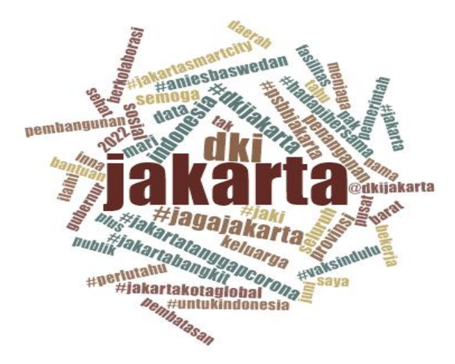
Figure 4. Focus issue in @aniesbaswedan account

Hashtags can affect every active user on Twitter social media, including young people. Young people dare to put a hashtag (#) on any information content on Twitter related to corruption cases. They have many options or choices to maximize the use of application features on Twitter and add their creative ideas to show their identity and existence in the developing political discourse. Twitter and young people have an inseparable relationship, especially the interest in the anti-corruption movement in Indonesia (Zahidi, 2023; Samosir, 2022).