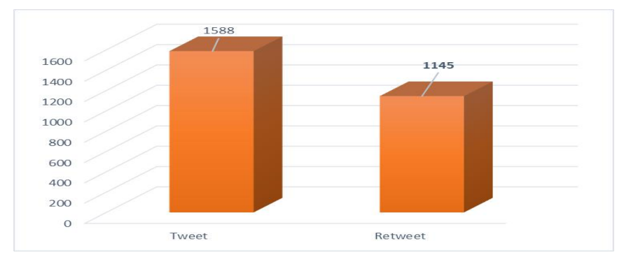
Figure 2. Tweet type intensity

The following figure presents the categorization of tweets, retweets generated due to an account's tweet, and retweet activities. The @aniesbaswedan account had 1588 tweets and 1145 retweets, which can be seen by the total number of tweets and retweets resulting from those tweets, according to the interpretation of Moro et al. (2023). The tweet content generated by the account can reflect and describe the tasks and responsibilities played by the account. Consequently, the high intensity of the performance in the tweet section also shows that this account can produce content independently. Ultimately, the material is intended for everyone who uses the Twitter social media platform.