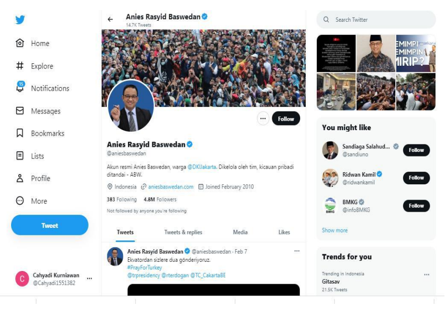
Figure 1. Account profile view

As can be observed, the presence of each account in the process of sharing information has been carried out for years. @aniesbaswedan account joined Twitter social media in February 2010. The graph below also shows that Anies Rasyid Baswedan's official statement is connected to various Twitter accounts by the number of followers is 4.8 M. This indicates that the account in question is original and is used by Anies Rasyid Baswedan as his official social media platform. Even the account @aniesbaswedan on Twitter has been given a verified account status, meaning it gets recognition as a valid account.