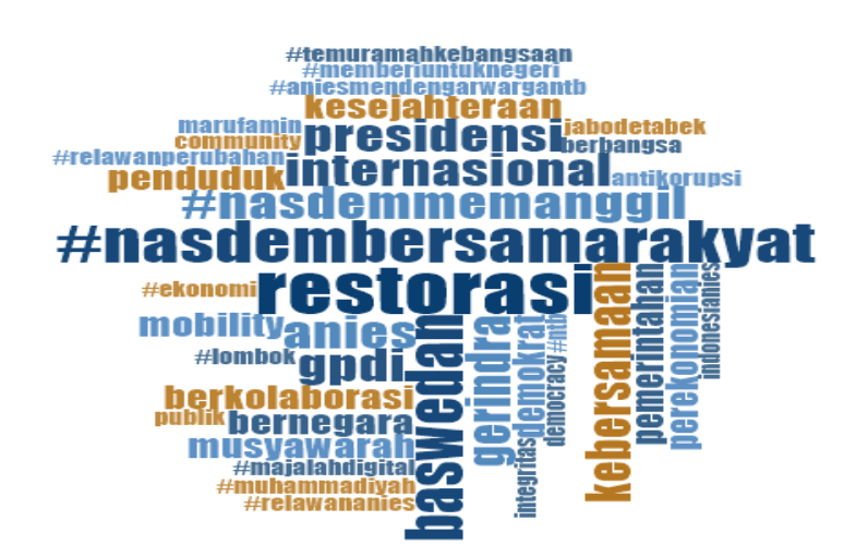
Figure 6. Main issues related to political communication themes on the @aniesbaswedan account

The @aniesbaswedan account had the most significant overall intensity of tweets and the resulting quarterly tweet intensity, with 79.65% of tweets having the restoration sub-theme. This account also had the highest number of tweets. In addition, political communication can be seen from the frequency of words that indicate other approaches that have been present and will undoubtedly provide support for the upcoming election process as political branding. It is hoped that political communications conveyed through social media can assist in facing the forthcoming 2024 elections.