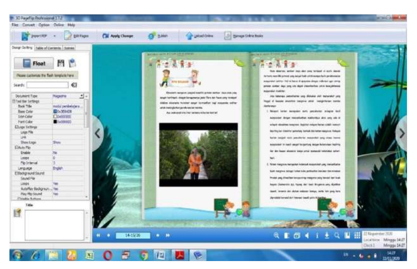
Figure 2: Contents view of the mangrove ecotourism e-module

E-modules that have been made are given to students whose perceptions will be measured later. The level of perception obtained for the three schools ranges from sufficient and suitable levels. These results indicate that the e-module is feasible to practice in the field. According to some experts (Asrial et al., 2020), The perception obtained by the researcher is included in the positive perception, which will affect the interest in learning and the character of students' environmental care. A positive perception shows the expression of students' comfort in using media which in this case is an e-module (Smith et al., 2021). Based on this, it can be concluded that students are comfortable learning using nature-based e-modules.