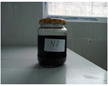
Figure no. 2. Preserved sludge sample for physico-chemical analysis sample code N8

to form a homogeneous sample of 2 kg, then all the indications mentioned in the Methodology chapter were followed. The constituted sludge sample was coded and sampled into 3 subsamples for the experimental tests that were carried out. The part of the sludge sample separated for physico-chemical determinations was preserved in jar glass (Fig. 2) and taken from the raw sludge (Fig. 3). The final product is shown in Fig. 4.