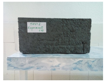
Figure no. 4. Final brick product sample code 2.08