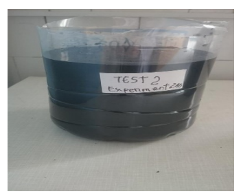
Figure no. 3. Raw sludge used in experiments

Figure no. 2. Preserved sludge sample for physico-chemical analysis sample code N8