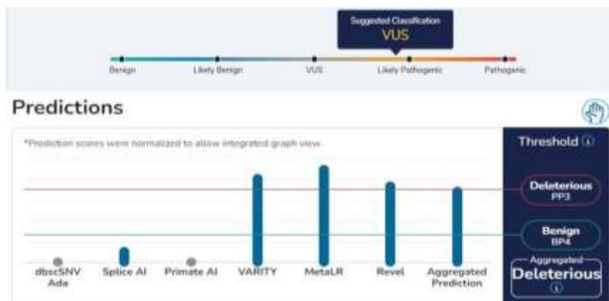
Fig. 3. Franklin database suggested the c.198A>C variant in exon 2 is likely pathogenic, as the VARITY, MetaLR, Revel scores, and aggregated prediction indicate that this variant is deleterious.