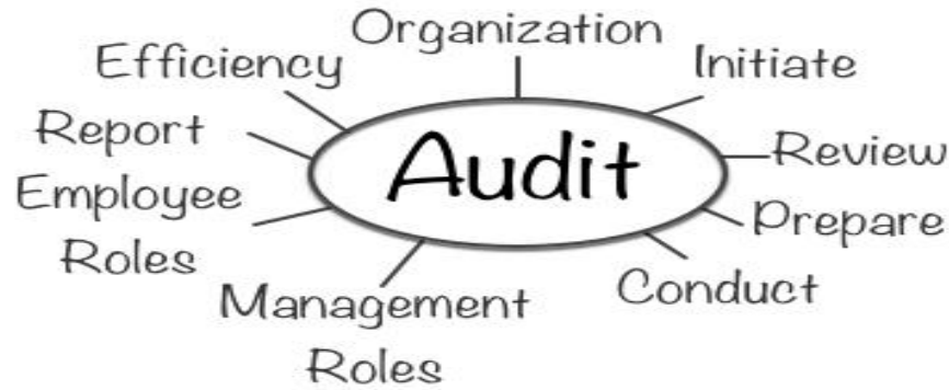
Figure no. 1 – Audit rules