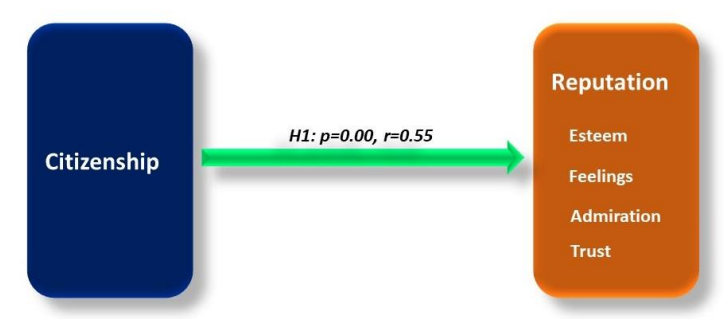
Fig. 1. The conceptual framework of the study

H1: There is significant relationship between IUKL citizenship and its reputation.