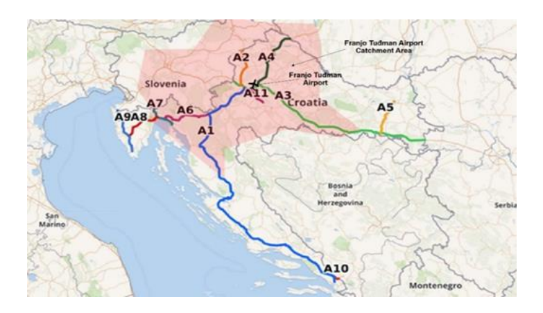
Fig. 3. The highway network in the Republic of Croatia in relation to the airport