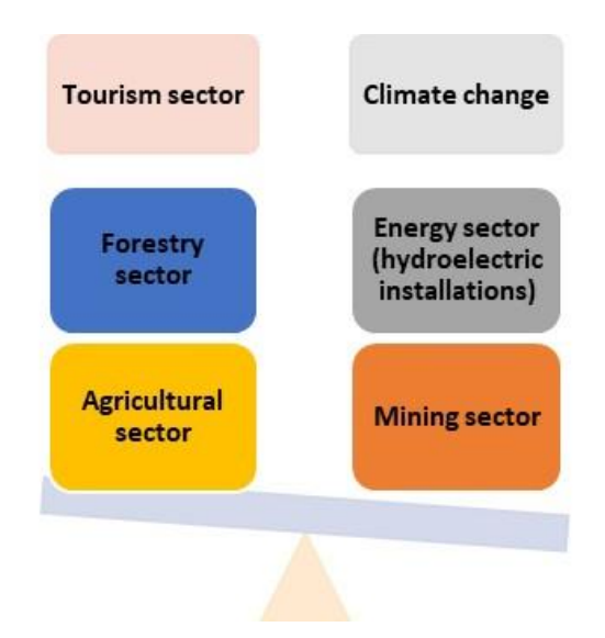
Figure 1. The change in the balance of the impact on mountain ecosystems in relation to the sectors involved

The development of mountain agriculture in different regions of the world is a real threat to some species, local biodiversity.