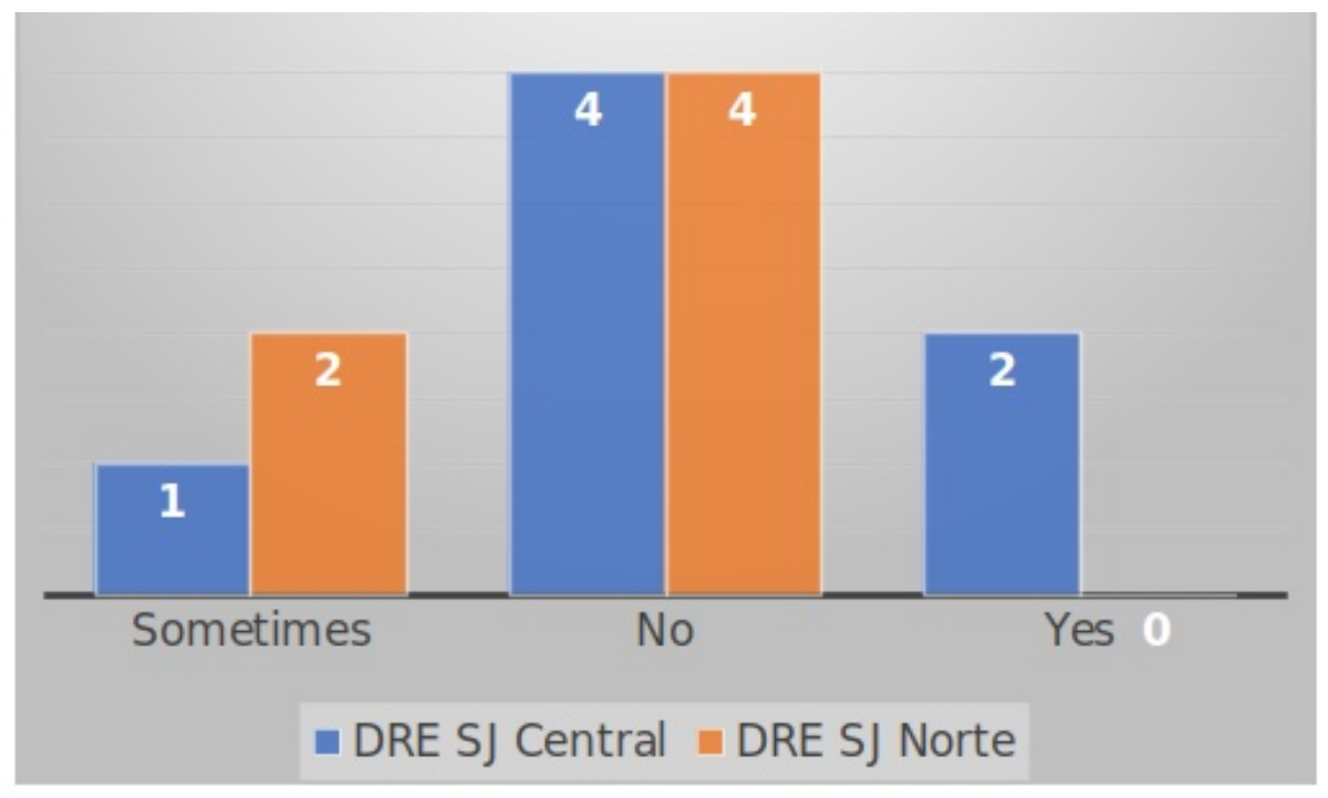
Figure 2 Teachers' Report on Task Cycle Completion

From the theoretical support of the Action Oriented Approach each lesson must be developed following the task cycle (Figure 2); it implies a pre-task, task rehearsal, task completion, and task assessment<sup>20</sup>. Teachers were asked whether they were able to complete the task cycle during the implementation of a phonemic awareness class.