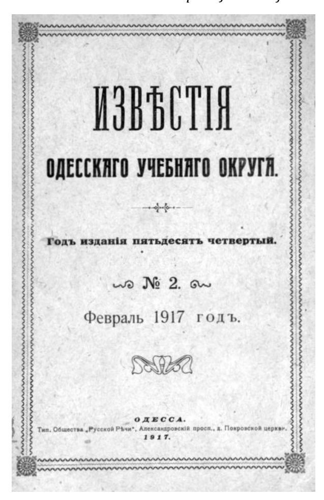
Fig. 1. Cover of the journal Izvestiya Odesskogo Uchebnogo Okruga. 1917. Issue 2

The circular section carried circular ordinances of the Ministry of Public Education concerned with various issues (e.g., the significance of directives issued by the Ministry of Public Education, the procedure for and ways of expending funds allocated by the government toward the preliminary military training of students, the recommendation of pedagogical works, the granting of deferment of call-up to persons of varying ages subject to military service, and the provision of percentage salary increments and one-time allowances in conjunction with the war) (Rasporyazheniya ministerstva..., 1917: 81-89).