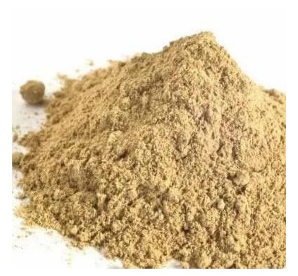
Figure 2 Triphala Churna

moisture and light. The prepared Triphala Churna shown below in figure 2.