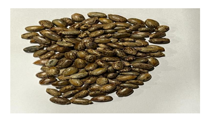
Figure 1 Ricinus communis (plant and seeds)