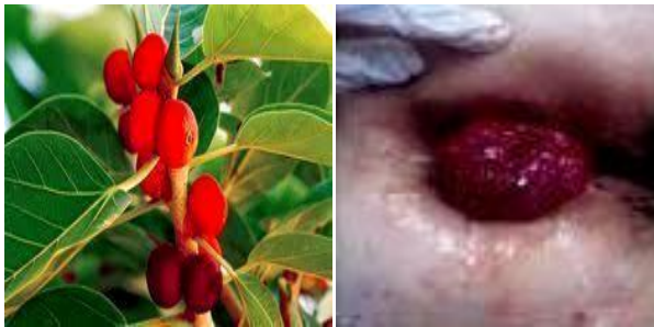
Image 5 Raktaja Arsha

External features of the Raktaj arsha, Looks similar to red coral, Nyagrodha praroh and Kakanantika Pushpa 9 . [Image 5]