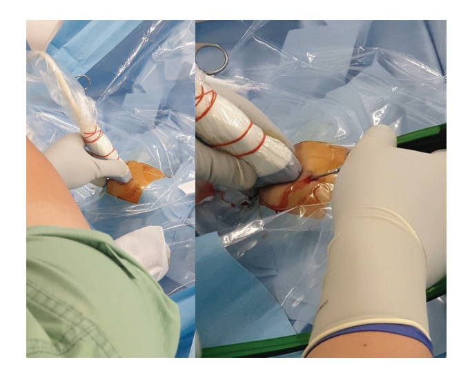
Figure 3 Left: US probe strategically placed on the lateral epicondyle to pinpoint the origin of the common extensor tendon. Right: Introduction of TX2 device (Tenex Health Inc., Lake Forest, CA, USA) following the meticulous creation of strap incision.