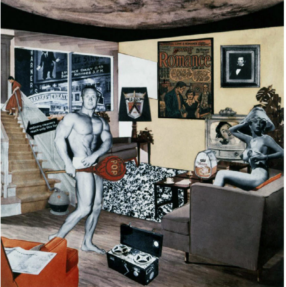
Figure 1. Richard Hamilton, Just what is it that makes today's homes so different, so appealing? , collage, Kunsthalle Tübingen, 1956.

distinct purposes. The home was once a passive setting where daily routines played out, largely hidden from the public eye, separate from the hustle and bustle of the workplace. These primordial needs emerge powerfully in the contemporary world, where expanded relational values have demonstrated their disruptive power (Fig. 1).