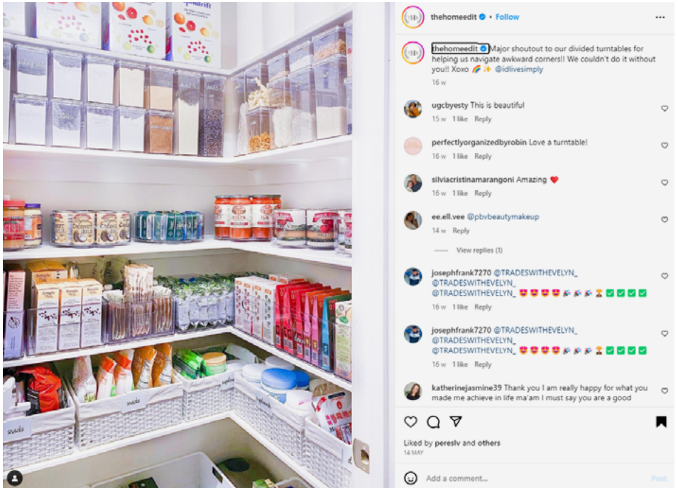
Figure 3. Clea Shearer and Joanna Teplin, Home Edit , social media account posting videos of organizing pantry in an extreme organized and satisfaction way, 2021. (Screenshot of Instagram profile @thehomeedit).

At first glance, it might seem paradoxical. In an age of boundless digital content, why would someone choose to watch another person organize their pantry or clean their living room? The answer lies in the inherent satisfaction derived from order, systemization, and the transformation of Space. These contents speak to broader cultural and societal trends. In a fast-paced world, there's a growing desire for simplicity, authenticity, and a return to basics. Watching someone engage in a simple domestic chore offers a moment of respite, a break from the complexities of modern life. It's a reminder of the beauty and satisfaction found in everyday spaces and