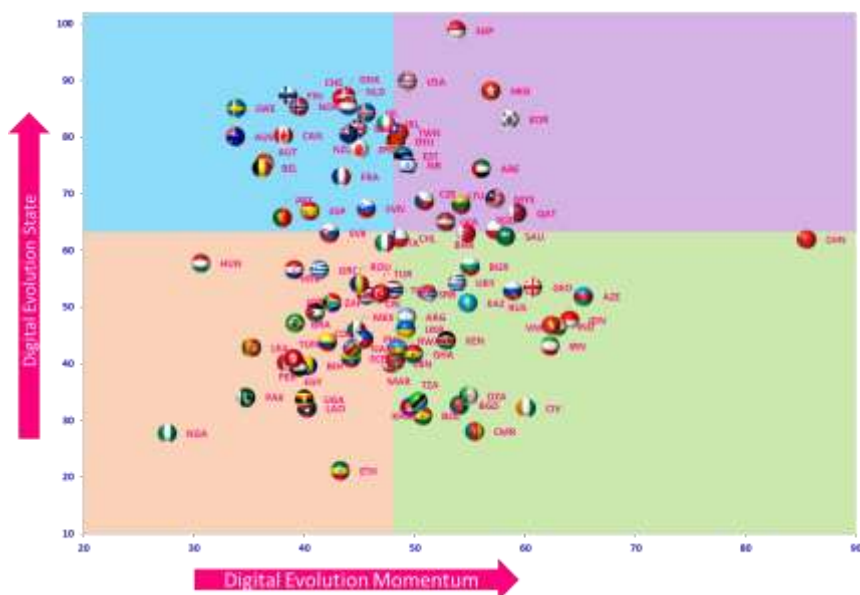
Figure 1. Digital Evolution Index (DDI) for 90 economies, 2019 year

Countries evaluated in digital intelligence index (DDI, December, 2020) are arranged by their digital evolution levels into four zones (“Break out”, “Watch out”, “Stand out” and “Stall out”). Georgia’s overall digital evolution score is 53.46/100 and ranks 47 th from 90 countries in the research (Figure 1). On the other hand, digital evolution is expanding, therefore digital evolution momentum (60.72/100) is high and ranks 7 th place in overall rankings. Accordingly, Georgia is placed to “Break out” of country groups where digital evolution levels are not too high but fast-growing. From the four main components of digital evolution (Supply Conditions, Demand Conditions, Institutional Environment, and Innovation & Change), by three components Georgia is aligned to “Break out” zone while the only “Innovation and Change” sub-component is aligned to “Watch out” zone. This means innovations towards digital evolution are slowly developing.