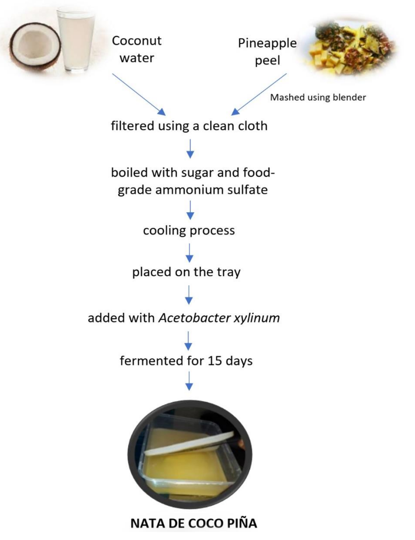
Figure 3. The flowchart of nata de coco piña processing.