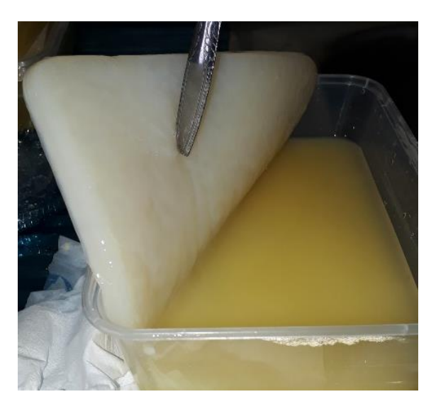
Figure 2. Nata de coco piña.