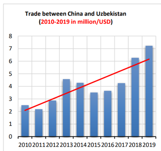
Figure 1. Trade between China and Uzbekistan (2010-2019)

In Figure 1 the dynamics of trade between China and Uzbekistan can be observed more vividly that the trade volume has drastically increased after the joint to the "Belt & Road" Initiative. Like other Chinese trading partners, the trade relationship with Uzbekistan is almost one-sided. China has been the first trade partner of Uzbekistan in recent years,