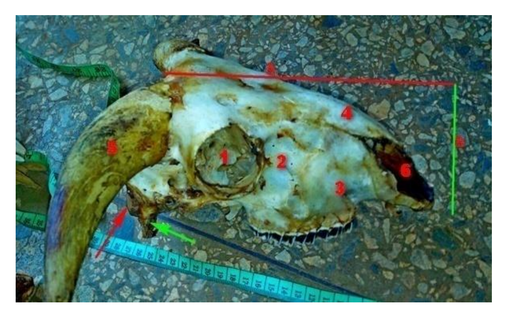
Plate 2 . Lateral view of the skull of Yankasa Ram showing: 1. Orbit; 2. Lacrimal bone; 3. Maxilla; 4. Nasal bone; 5. Cornual process; 6. Incisive bone; A. Length of skull; B. Height of skull; Green arrow. Jugular process; Red arrow. Occipital condyle.