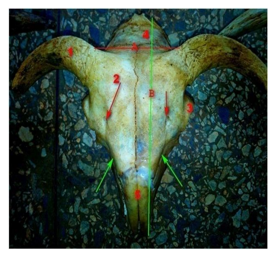
Plate 1 . Dorsal view of the skull of Yankasa Ram showing: 1. Cornual process; 2. Frontal bone; 3. Orbit; 4. Inter parietal bone 5. Nasal bone; A. Width of the skull; B. Length of the skull; Red arrow. Supraorbital foramen; Green arrow. Infraorbital foramen.