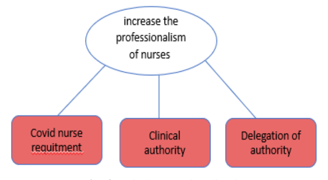
Fig. 3: Mind Map Visualization

Analysis result Word Frequency Query that the words that appear most often are nursing committee, authority, and delegation action. Meanwhile, the results of the analysis related to the themes found in this study can be seen in the visualization of the mind map data in Fig. 3.