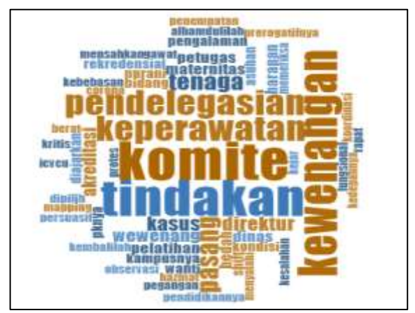
Fig. 2: Analysis of Word Frequency Query

To explore words that often appear in research data, using Word Frequency Query analysis , is more effective and efficient in thematic analysis with large text documents (Bandur 2019). The results of this Word Frequency Query analysis can be seen in Fig. 2.