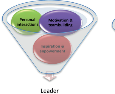
Figure 3. Defining a leader

In the following chapters, the author will be going through the key points of the empirical returns of the interviews. The research gave the author reason to ask whether there is a difference between a "manager" and a "leader". The graphics below are based on the interviews.