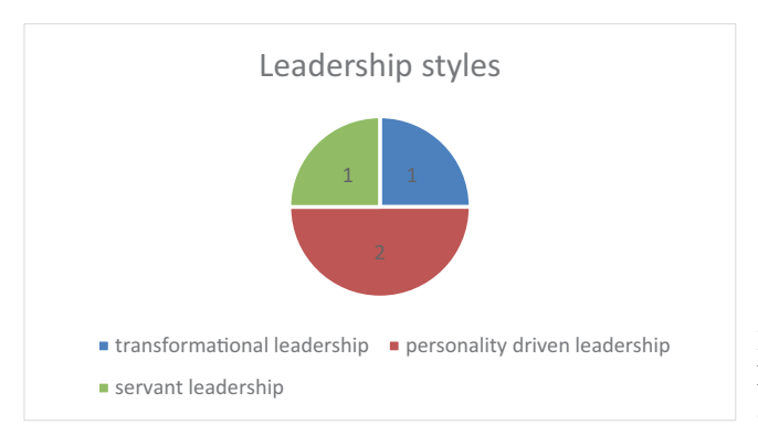
Figure 5. Preferred leadership styles

Being asked what they would consider the most appropriate leadership style in their area of expertise, the experts responded as follows: