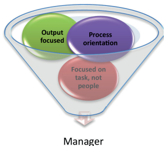
Figure 4. Defining a manager