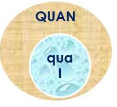
Fig. 2: Concurrent Embedded Design Representing the Current Mixed Methods Study. [Source: Creswell (2009, p. 210)]

quasi-experimental approach for the quantitative part and supportive qualitative data collection methods (See Fig. 2).