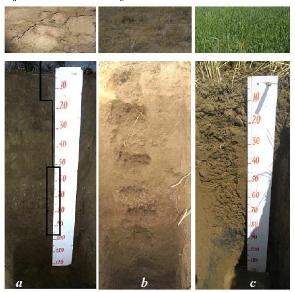
Figure 2. Gleysols (a), Calcisols (c) and Anthrosols (c) of Mugan lowland

characteristic for the soil profile and the dissolved salts are accumulated at 50 cm of depth. These soils correlate to Haplic Calcisols (Gleyic, Salic). These soils spread in an associated form with the saline soils. A main characteristic feature of the Calcisols is accumulation of secondary carbonates in the soil profile. Oxidation-reduction process indications which are created under the groundwater effect are taken into account at a second level. Though this process was clearly given in the national classification, it was distinguished in the gender and sort taxa. The main morphological characteristics of characteristic pedons were given in Table 1. A main characteristic feature in the irrigated meadow-grey soil type is Irragric horizon formation as a result of the long irrigation and cultivation. The irrigated meadow-gray soils of the study area have been formed on the Araks river basin. These soils are irrigated by the channels separated from Araks River. Araks river has high content of mineral and nutritional content. The mineralization of irrigation water is 560-880 mg/l. Morphological and diagnostic indicators of soil have changed considerably as a result of irrigation of cultivated areas using these waters.