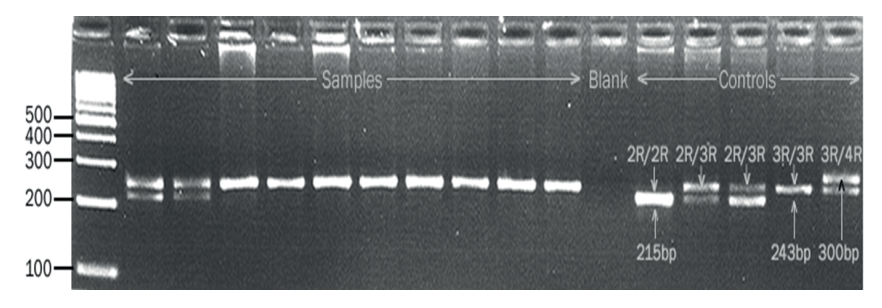
Figure 2. PCR results of TSER 5'-UTR 28 bp 2R/2R polymorphism produced 215 bp fragments, 2R/3R variants produced 215 bp and 243 bp fragments, 3R/3R produced 243 bp fragments, whereas 3R/4R produced fragments of 215 bp, 243 bp, and 300 bp. This examination used 100 bp DNA ladder marker.

were similar to those of previous studies that found no relationship between leukemia based on FAB classification and MTX resistance.(3)