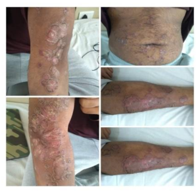
Figure 1 (Before treatment) Skin examination: