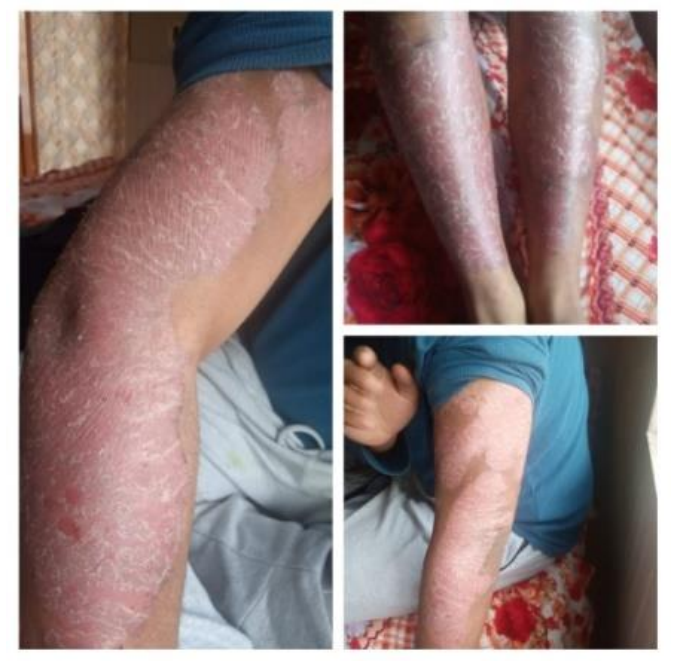
Figure 3 (After Basti/treatment)