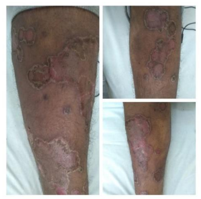
Figure 2 (After virechana)

Shastrokta Virehana (Classical purgative therapy) was done followed by Ikshurasa basti (Sugarcane juice enema)<sup>10</sup> in the form of Kala basti . Snehapana (intake of medicated ghee) followed by Virechana was administered on the patient. During the course of snehapana with Tiktaka Ghrita, complaints like Kandu and Rookshata over the lesions got reduced gradually. After Virechana , thickness of the scales and itching over the lesions reduced by 30% and no new lesions were observed (Figure 2).