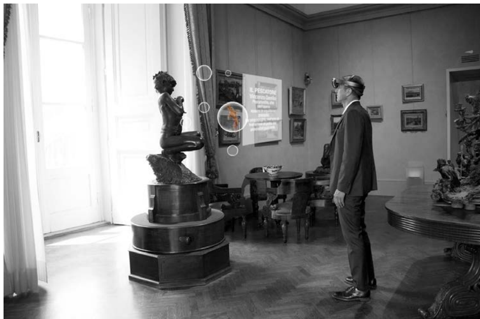
Figure 1. Pescatoriello Mixed Reality experience in the Ottocento Privato section, Museum of Capodimonte, Naples.

acoustic markers and recalls, therefore with a redundant approach, is motivated both by the aim to make the experience simple and fluid, even to people who are not very familiar with these technologies, but also to adapt it to a large range of people categories. A gesture command that allows to repeat an already used content is provided.