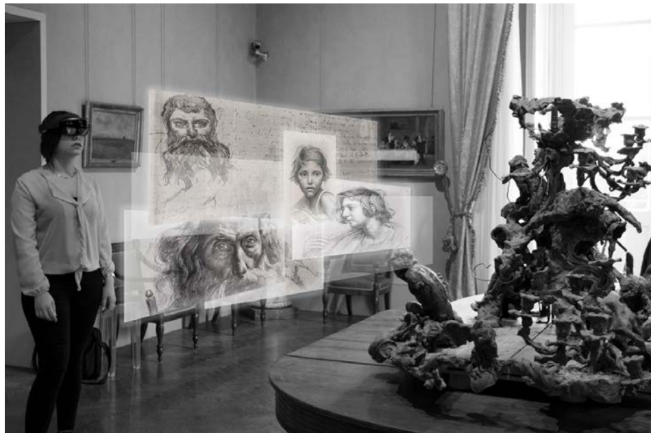
Figure 2. Trionfo della Tavola Mixed Reality experience in the Ottocento Privato section, Museum of Capodimonte, Naples.

Gemito from King Umberto I in 1886, which should have been made in silver for the dining room of the Real Palace of Capodimonte.