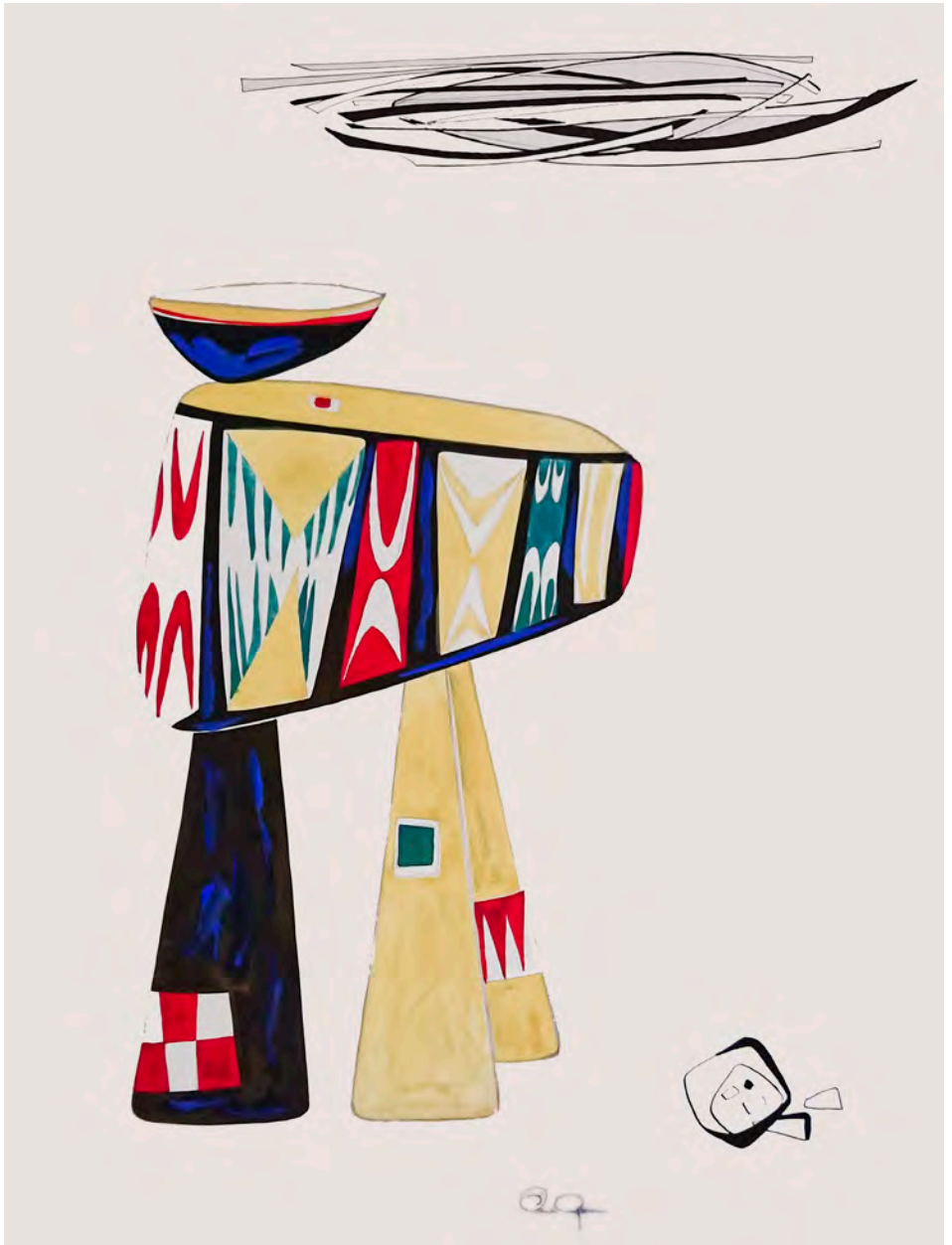
Figure 5. Clara Garesio; Study drawings; Variations on graphic decorative abstract theme and sculpture, original table size 70 x 100cm; Personal archive of the artist.