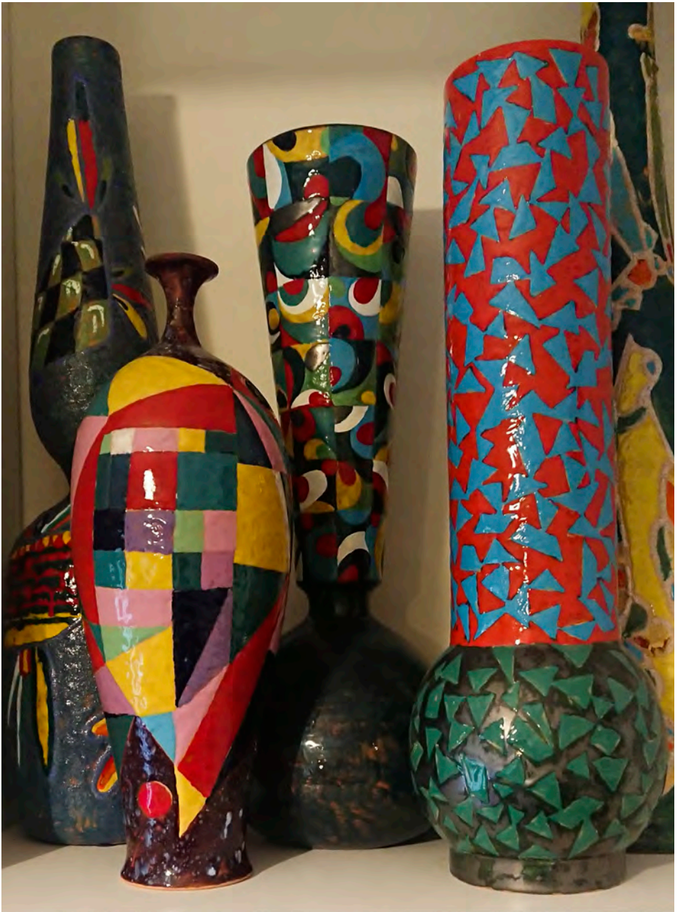
Figure 9. Vases with various decorative themes and shapes. Personal archive of the artist.