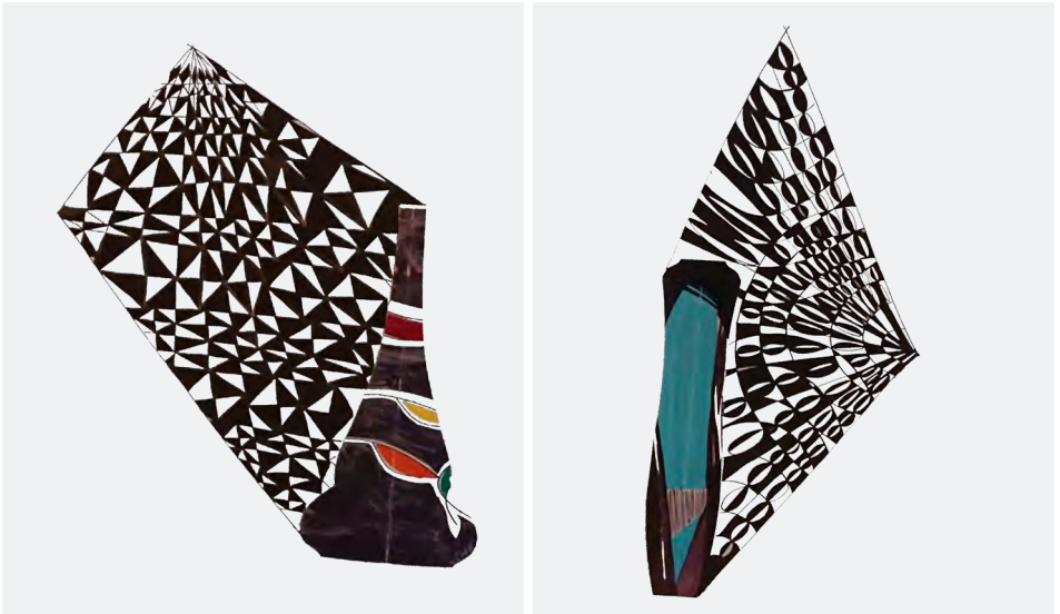
Figure 6. Clara Garesio; Study drawings; Variations on graphic decorative abstract theme, original table size 70 x 100 cm. Personal archive of the artist.

A reportage project, his research initially focused on the historical tradition and eventually reached an innovative solution, namely a series of unfinished objects . More specifically, spaghetti shaped models of ordinary objects, in drawn ceramic paste, were braided like twigs. Trays, cups, candleholders, and lamps were all used to train young apprentice craftsmen, and revealed the need to promote learning processes by using ceramic manufacture instead of finished items (Guida, 2020). It came to be an instruction manual that could be used and customised by each craftsman and as it enabled a diversified mass production.