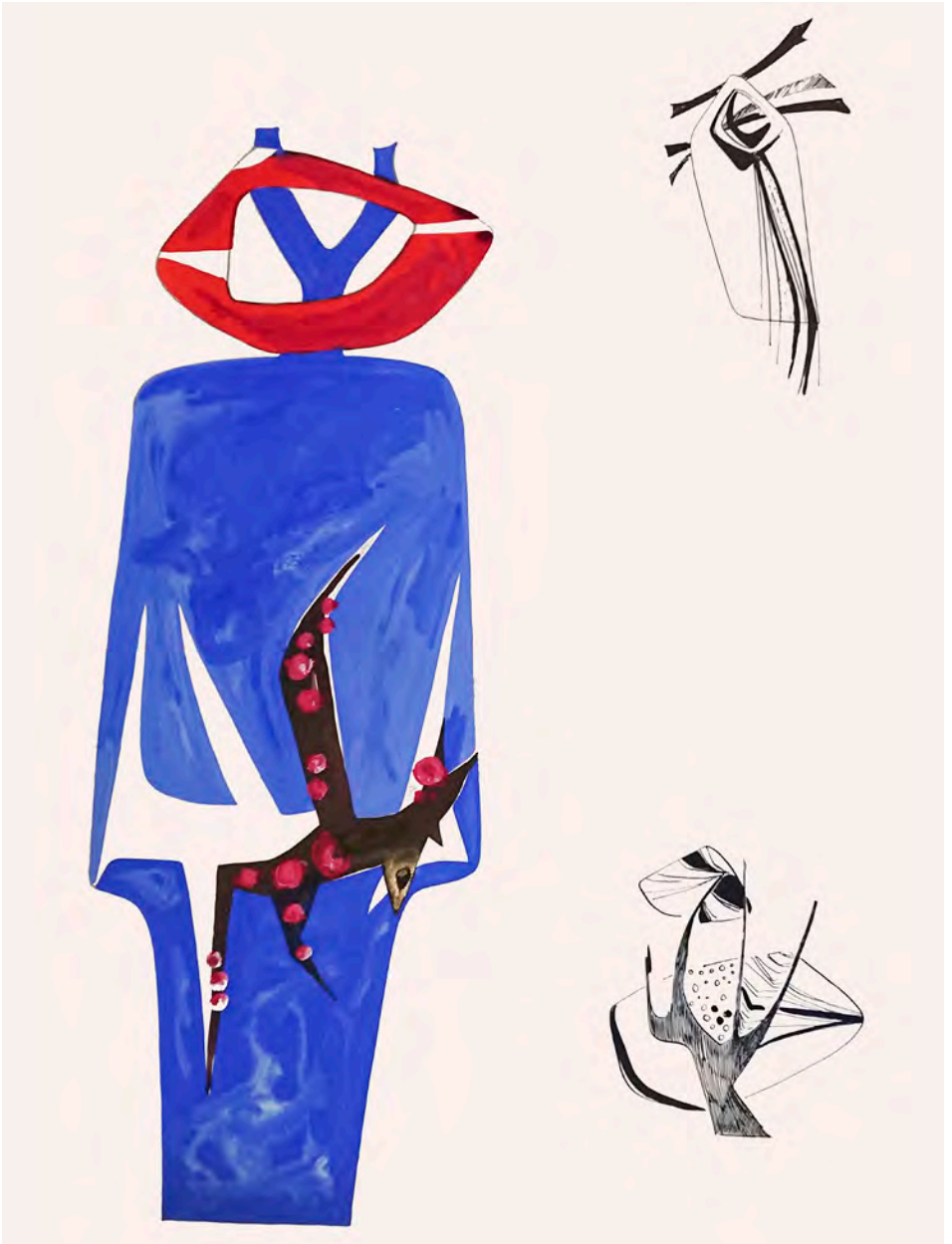
Figure 2. Clara Garesio; Study drawings; Variations on graphic decorative abstract theme and sculpture, original table size 70 x 100cm; Personal archive of the artist.