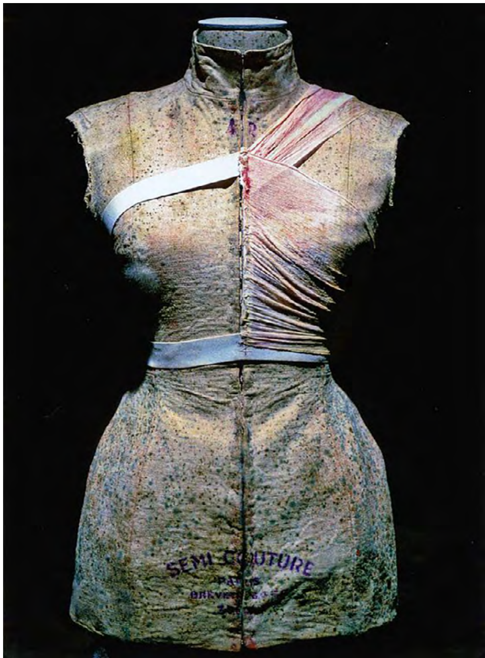
Figure 1. La Maison Martin Margiela , Rotterdam 1997.