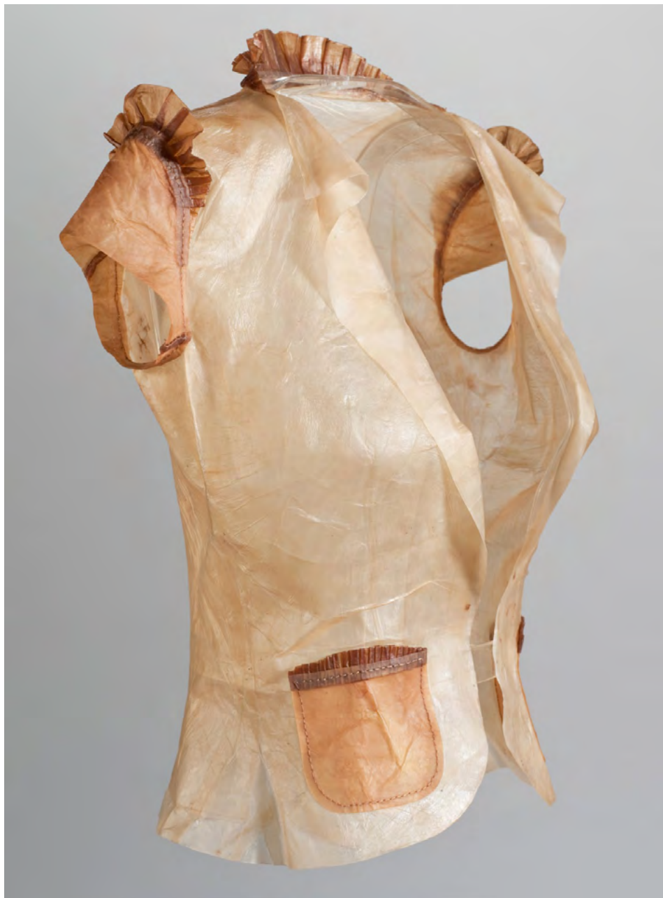
Figure 2. Suzanne Lee, BioCouture in microbial cellulose, 2010.