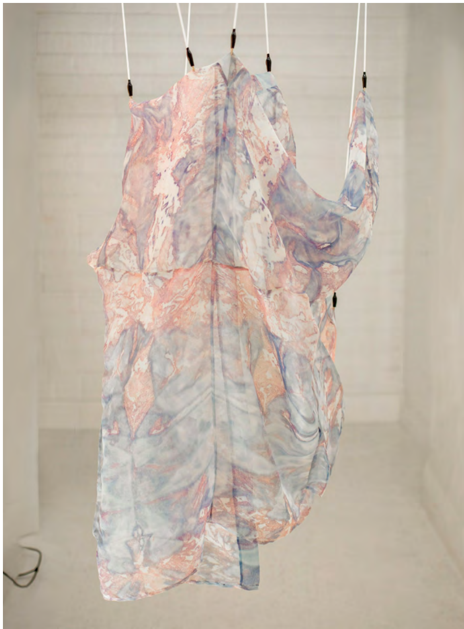
Figure 8. Natsai Audrey Chieza, Project Coelicolor: Assemblage 001 . Faber Futures, London 2017.