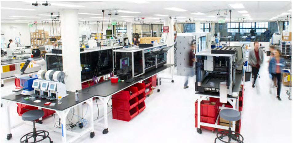
Figure 5. Ginkgo Bioworks Laboratories, London 2020.

Based in Paris, the Pili company, on the other hand, adopts sophisticated biotechnology combined with the use of ancient fermentation processes, using enzymatic waterfalls to transform raw materials into textile dyes. The basic idea is to integrate enzymes into bacteria that are subsequently grown in bioreactors where sugar acts as the primary energy source.