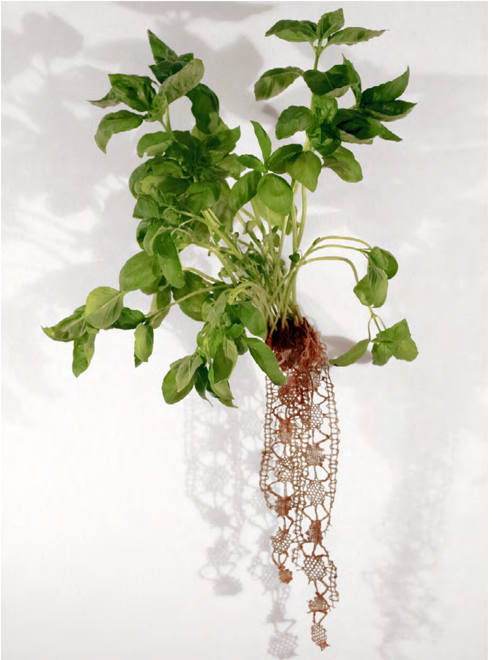
Figure 3. Carol Collet, BioLace , London 2013.