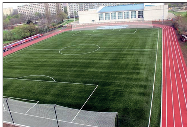
Fig. 1. The athletic stadium of Kuban State Technological University

To inspect safety of racetracks, the athletic stadium of Kuban State Technological University (KubSTU), which location is Krasnodar, Moskovskaya str., bld. 2, has been chosen. The photography of it is in Fig. 1.