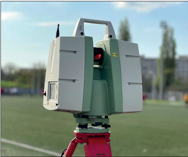
Fig. 2. Laser scanner Leica ScanStation C10