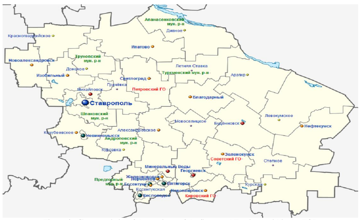
Figure 4 - Characteristics of the territory of the Stavropol Territory within the TOP