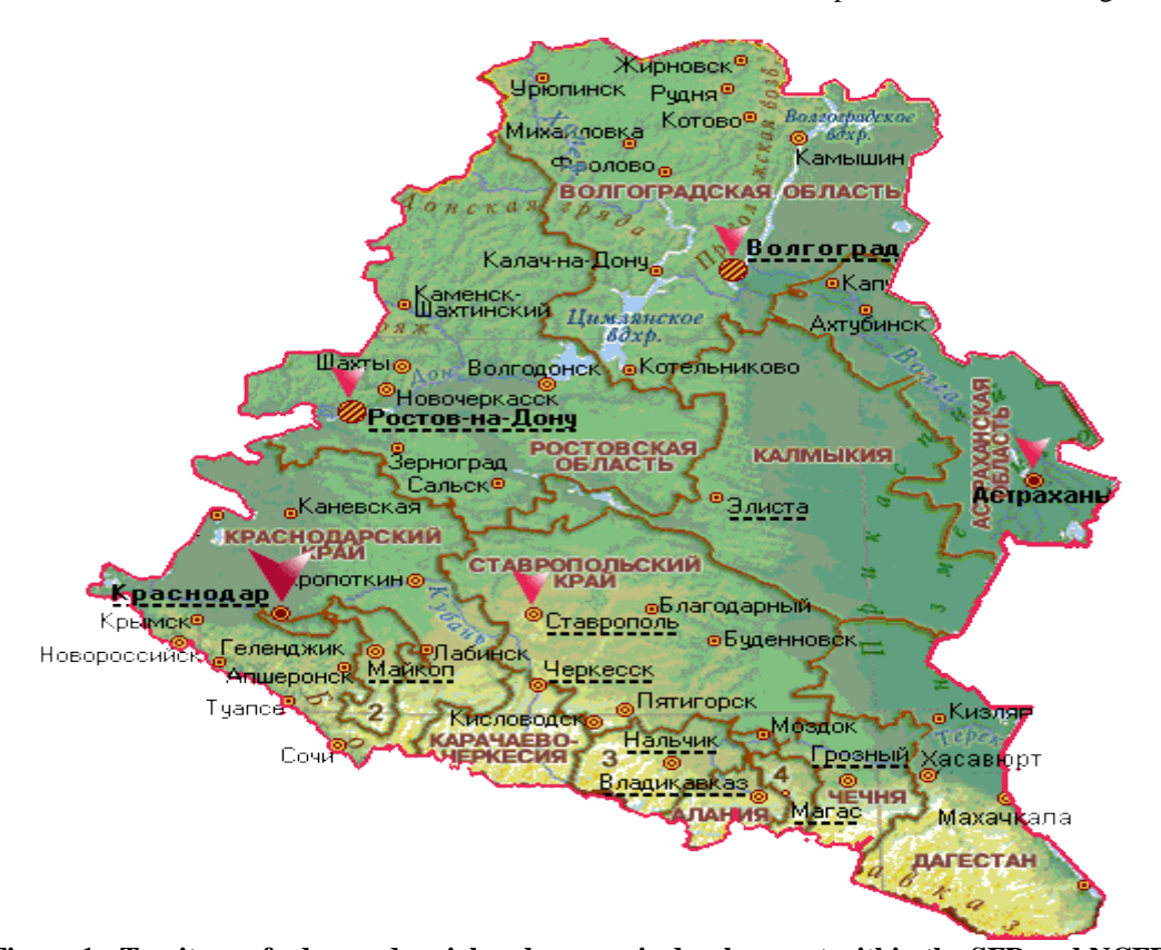
Figure 1 - Territory of advanced social and economic development within the SFD and NCFD

The characteristics of the territories included in or involved in the territory of advanced social and economic development are shown in Figures 1-6.