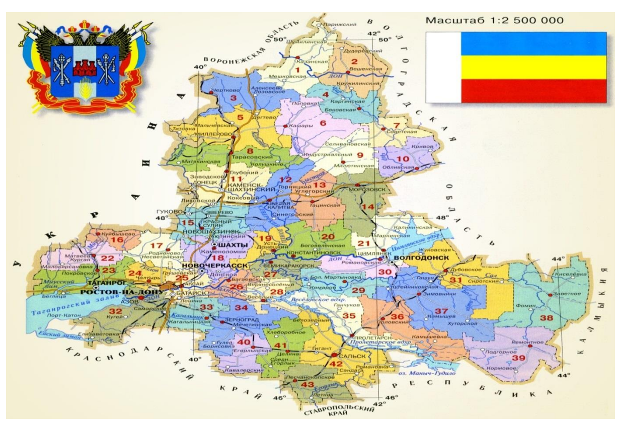
Figure 2 - Characteristics of the territory of the Rostov region within the TOP