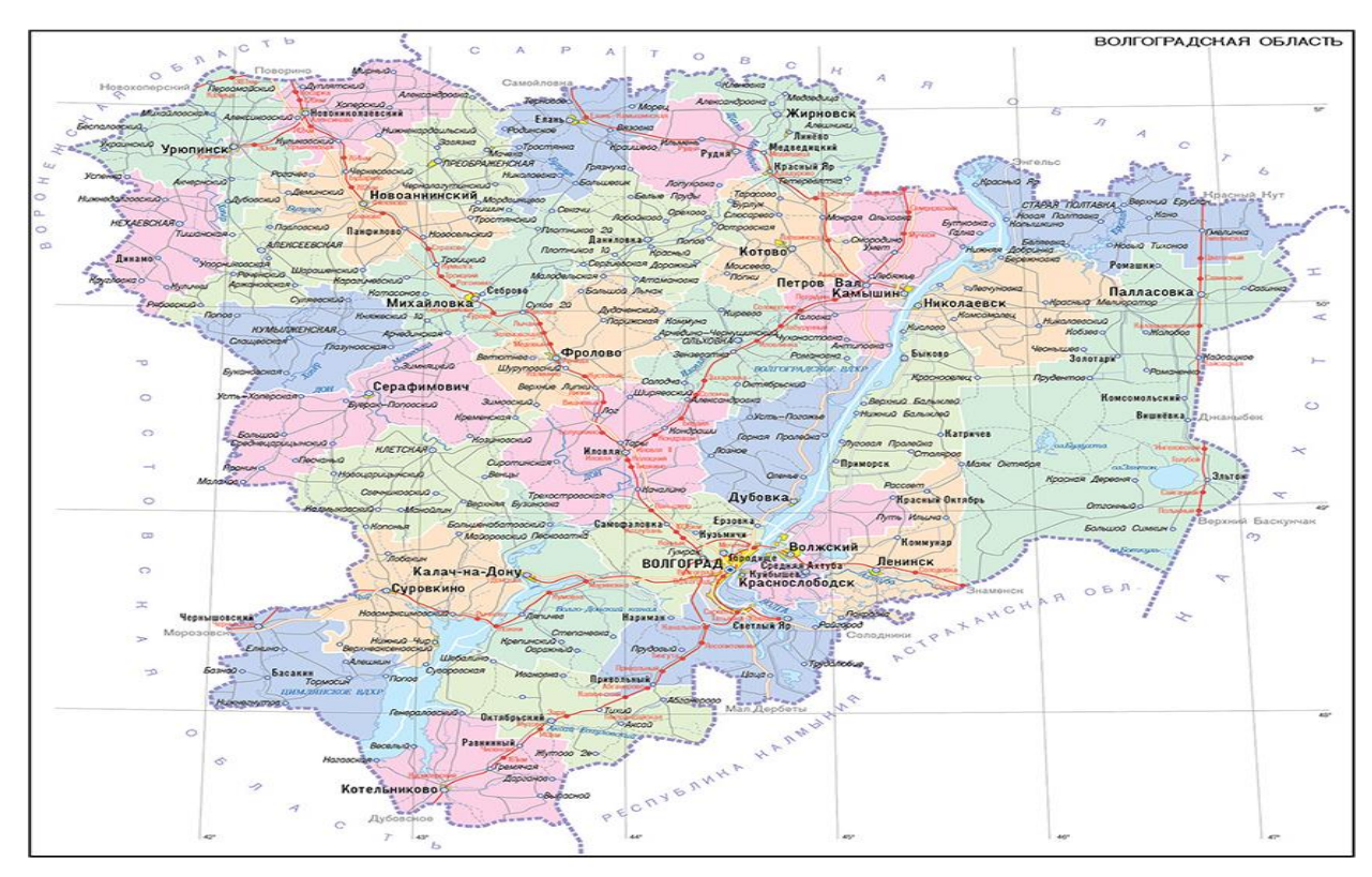
Figure 5 - Characteristics of the territory of the Volgograd region within the ASEZ