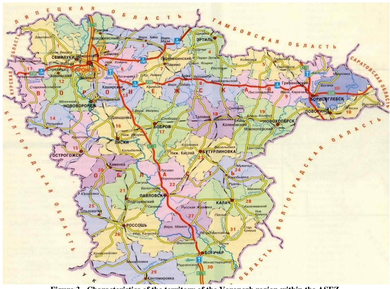
Figure 3 - Characteristics of the territory of the Voronezh region within the ASEZ