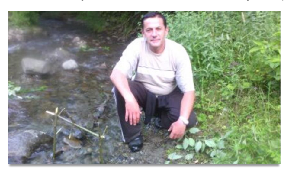
Fig. 3. Author of the text GR on Rajova (Rajovića ) River (into which flows Trečnjevička smail river) – favorite place to relax in the summer months (Bulatović et al,2018).

into small vortices, below Lomova Dragoja Rajovića and Krčevine Arsovića and Rajović where the depth of the river is the greatest, and its flow the calmest, and it is characterized by a smaller longitudinal fall of the bottom and more moderate changes in hydrological parameters. The riverbed is indented, as the longitudinal fall decreases, there is an increasing tendency to curve.