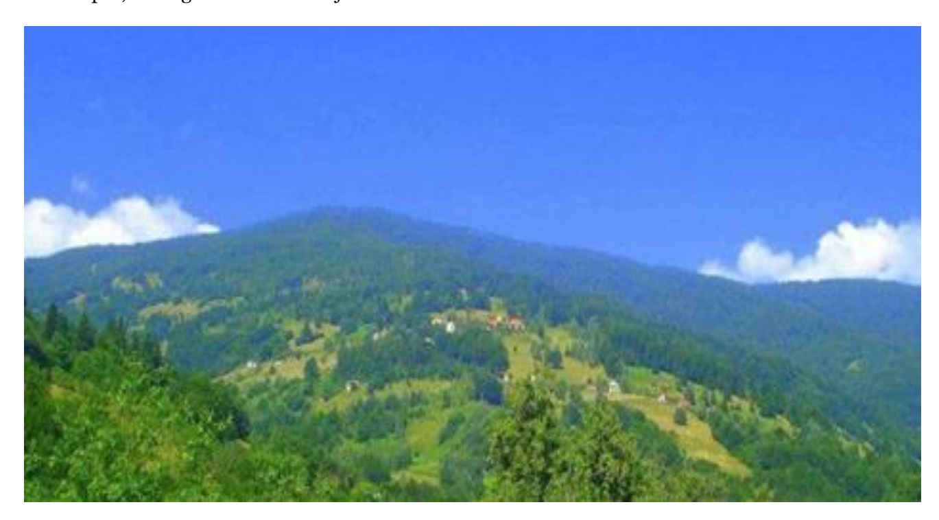
Fig. 1. View of the slopes of Trešnjevik – a masterpiece of nature

Lieskovský et al. (2017) citing research Daily (1997), Jianija (2018), Fisher (2010) and Hamududu and Killingtveit (2012) emphasizes that – aesthetic value can be defined as the pleasure that people receive from scenic beauty provided by natural areas and landscapes. It is essential for people's well-being, for their physical and psychological health. Identification of aesthetic valuable landscapes is helpful in defining areas to be placed under protection or for landscape planning. The aesthetic value of a landscape is based on properties of the landform, structures, climate, vegetation and so on and the way they work together. It is what the landscape offers us but it is sensed and appreciated subjectively. Lieskovský et al (2017) further emphasizes that studies on landscape aesthetics have been carried out since the 1960s. There are two ways to evaluate landscape beauty: subjective and objective approach. In the first case, the assessment is done by observer. The evaluation depends on personal factors like age, gender or education. In the second case, the objective approach is based on expert analysis of the landscape. Standardized approaches for the assessment and monitoring of landscape aesthetics are still missing (see Leach, Moore, 2010; Nayyeri, Zandi, 2018; Lester et al., 2013). In this text, we indicate only partial images of landscapes, having in mind the subject of research.