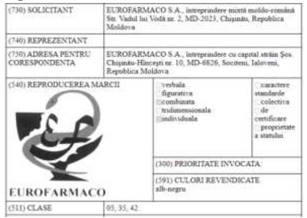
Figure 2. The EUROFARMACO trademark

Industrial property rights include trademarks, patents and industrial designs. A trademark is a unique sign used to identify a product or a service. It can be a single word or a combination of words and numbers. Drawings, 3-D signs, or even symbols can constitute a trademark. For instance, "CRICOVA" is a famous national trademark with its own Registration Number 5389614 and Registration Date 2018-01-30, as well as "Floravita" oil (AGEPI, BOPI, 2017, p.102). The trademark application can be filed at national or regional levels depending on the extent of protection required. The same criteria meet medical facilities, instruments, machines and so on. For example, the well-known Moldovan-Romanian joint venturen "EUROFARMACO" has its own trademark (Figure 2) (Registru National al Cererii, 2021).