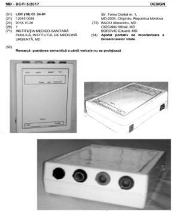
Figure 4. An industrial design of the portable monitoring device of vital bio signals

An example from 2017 BOPI magazine is a portable monitoring device of vital bio signals (AGEPI, 2017, p. 126) (Figure 4).