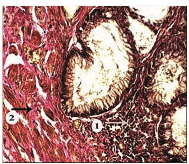
Figure 2. Main group. Small intestine. Signs of nonspecific inflammatory process in the mucous membrane: focal lymphocytic infiltrates (1). Sclerosis of its own plate of the mucous membrane, with focal replacement of its own plate (2). Van Gieson picrofuxin staining with Weigert hematoxylin staining of cell nuclei. Photomicrograph. Lens. 40<sup>x</sup>. Eyepiece. 10<sup>x</sup>. Table 1. Morphometric characteristics of small intestine tissue in the study groups (X\pm Sx)