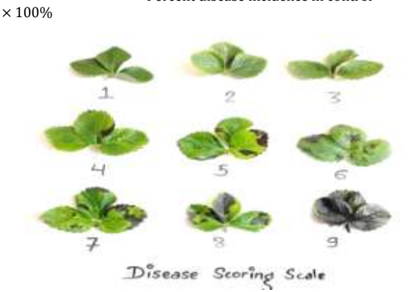
Fig. 1: Pictorial disease scoring scale

= Percent disease incidence in control – Percent disease incidence in treatment Percent disease incidence in control