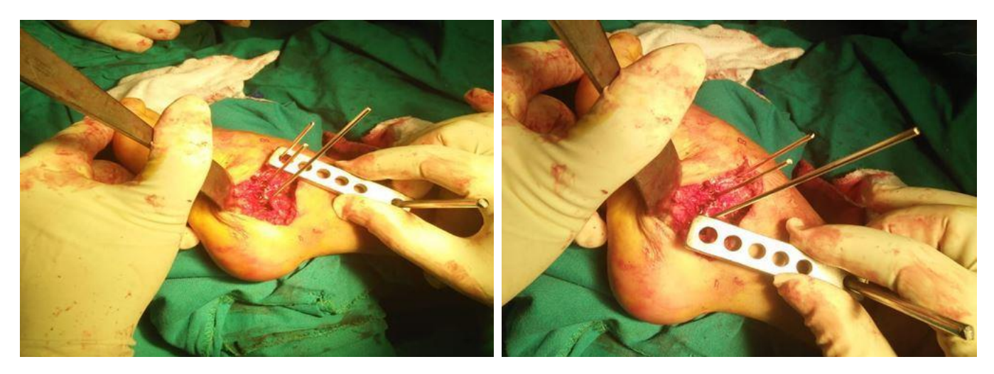
Figure 3. Intra-operative photos.

starting from the superior edge of the calcaneal body and ending at the superior edge of the talar body to draw the line of osteotomy, then curved osteotome 15 mm is used to connect the dots (Figure 4). It is important to confirm that the osteotomy is complete under C- arm and by being able to move the fragment on either side of the osteotomy. Skin is closed and dressing is done then the tourniquet is deflated.