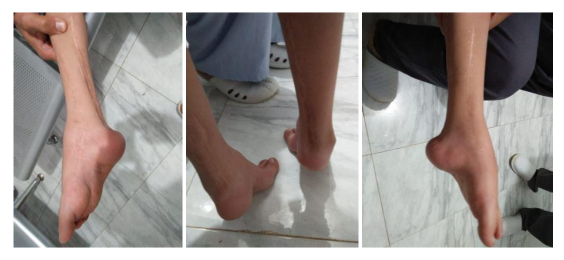
Figure 1. Pre-operative clinical photos.

the anteroposterior foot view, talocalcaneal, talus-first metatarsal, and calcaneal pitch angles together with the tibiotalar angle in lateral ankle view were useful in confirming the final clinical improvement though we missed documenting them or considering them in our parameters and depended on the clinical angles.