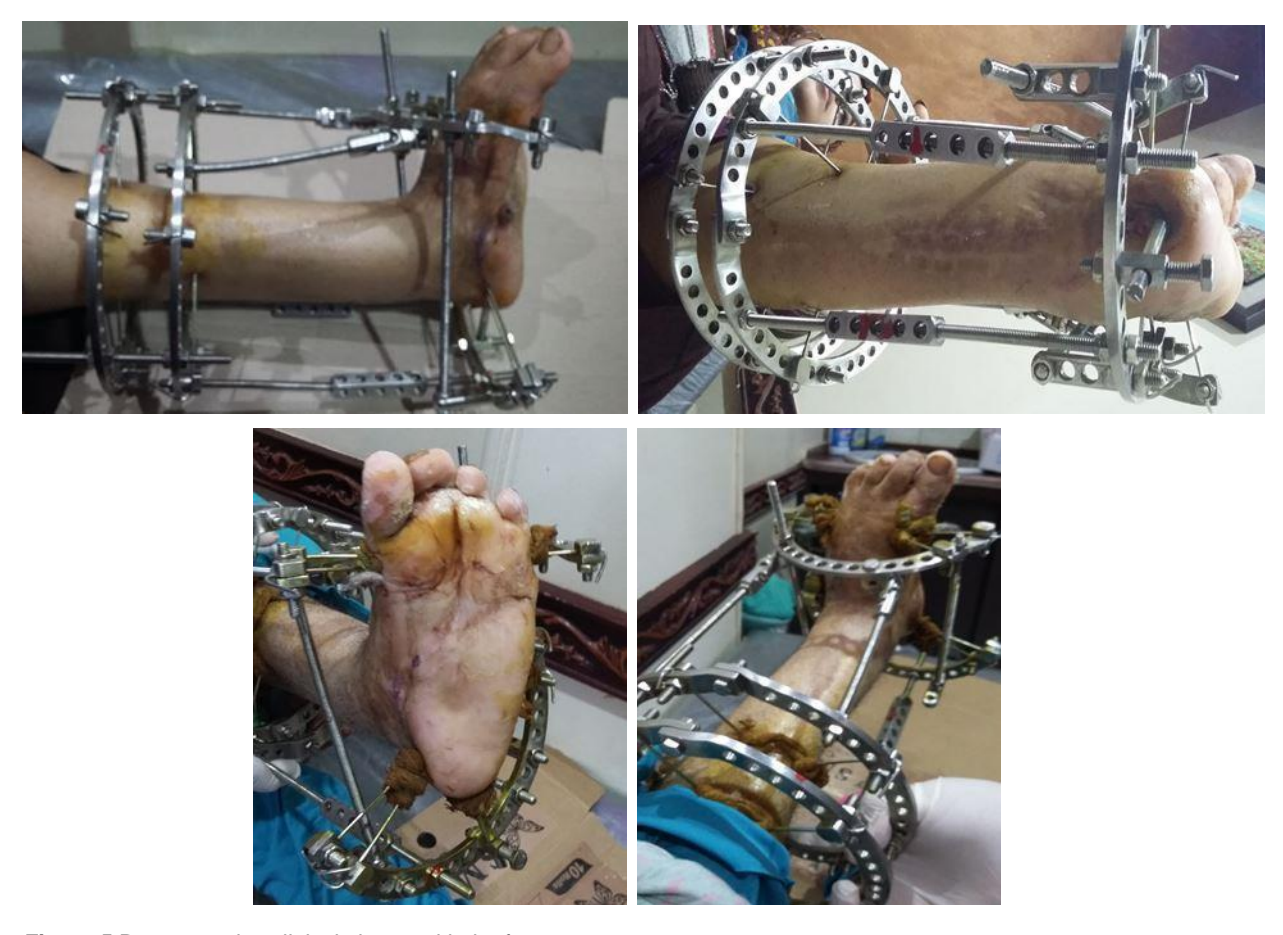
Figure 5 Post-operative clinical photos with the frame.