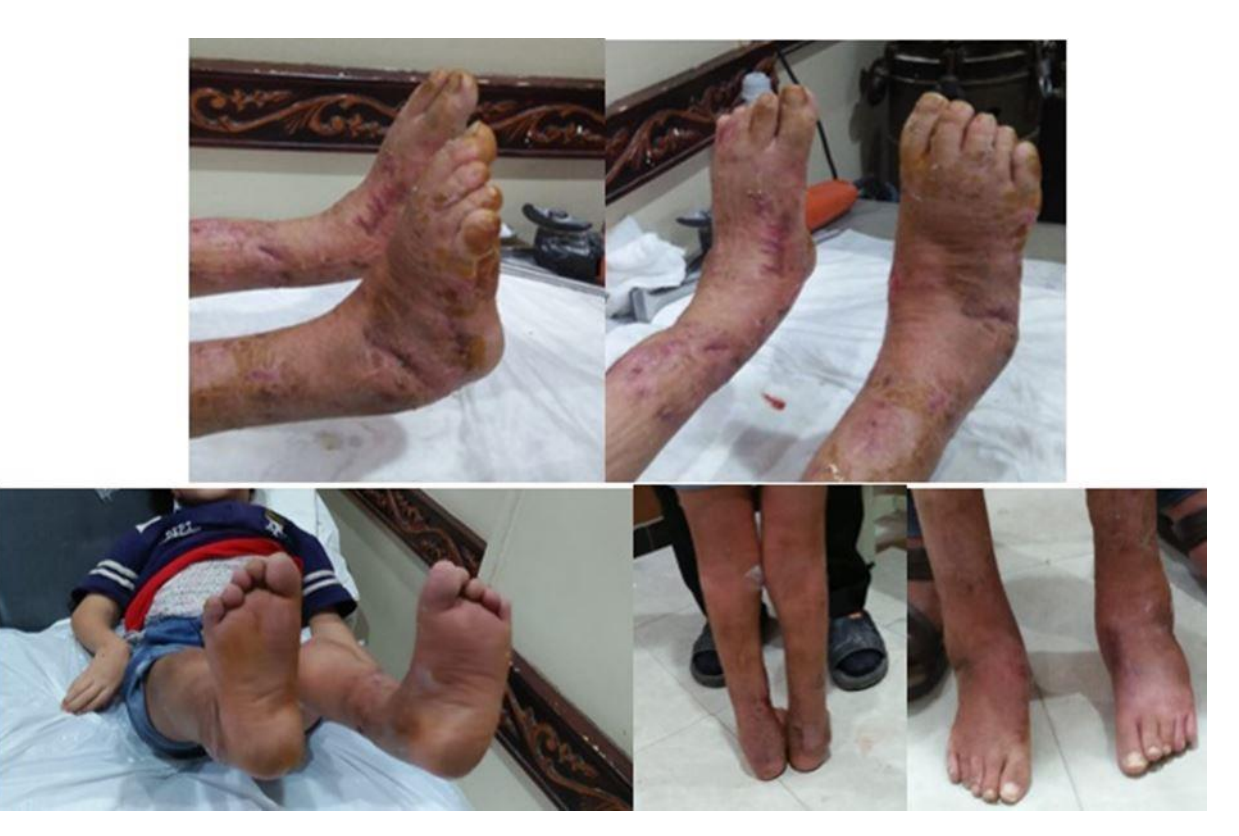
Figure 6. Clinical photo of one of the bilateral cases immediately after cast removal and on follow up.

Thus gradual correction with the Ilizarov technique gave satisfactory results in failed post-surgical rigid, recurrent equinus deformity.