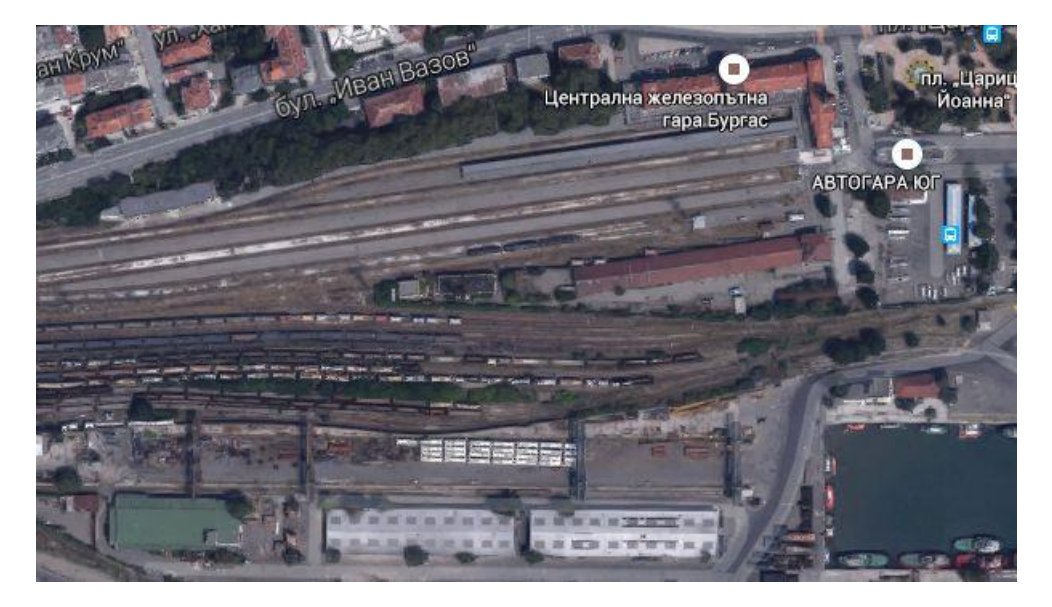
Fig. 2. Fragment of railway station in Burgas, obtained during the satellite imagery

Figure 2 shows the result of space monitoring, namely railway junction as a fragment of transport infrastructure. This image was obtained in the visible spectrum.