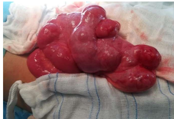
Fig. 1. Intraoperative photograph showing the ileal loops entrapped in a fibrous cocoon with scattered serial outpouchings.

At diagnostic laparoscopy there were multiple dense inter loop small bowel adhesions forming a fibrous cocoon leading to poor visualization and limited working space necessitating a conversion to a laparotomy. In addition to confirming the laparoscopy findings, the distal jejunal and ileal loops had multiple serosal out-pouchings (Fig. 1). There was minimal gelatinous free fluid with no peritoneal or omental deposits. The uterus, ovaries and tubes appeared normal. After complete adhesiolysis and release of the entrapped bowel from the cocoon, it was noted that there was no residual mechanical obstruction and enteric content could be milked freely into the colon. An incidentally noted Meckel's diverticulum was excised and the wall of the cocoon was sent for histopathological examination.