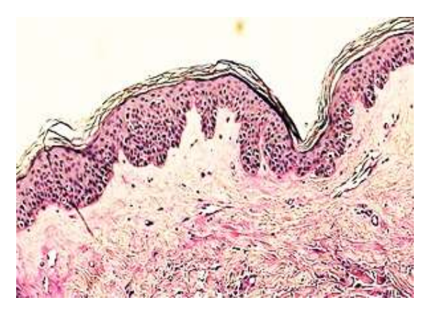
Fig 3. Hyperkeratosis in the epidermis and loss of rete edema in the papillary dermis with collagen homogenization, and an underlying lymphocytic infiltrate (H&E x 100).

revealed hyperkeratosis in the epidermis and loss of rete edema in the papillary dermis with collagen homogenization, and an underlying lymphocytic infiltrate (Fig. 3).